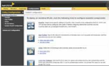
Easy guided configuration.

HiveManager enables policy creation, firmware upgrades, config updates, and centralized monitoring from one console