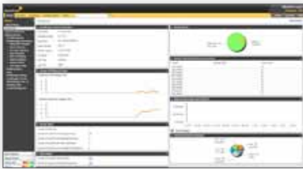
Dashboard enables real time monitoring.