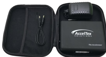
Battery in Portable Carrying Case