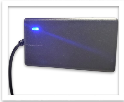
BLUE = Battery is fully charged