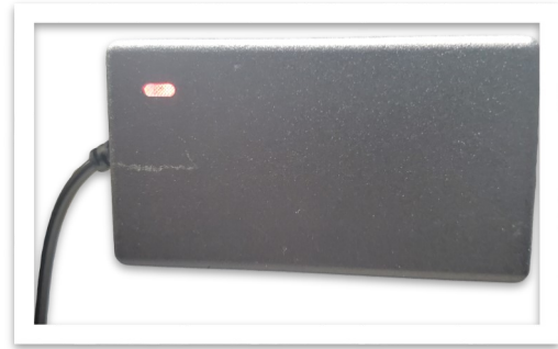
RED = Battery is charging

NOTE: If the light is flickering between Blue and Red, this may occur when a battery pack is charged to 100% while a device is connected.