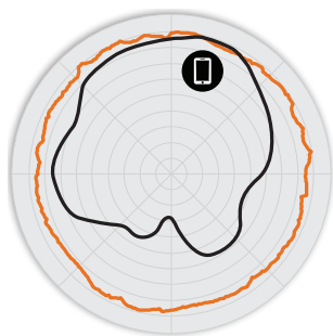
Figure 2. R730 2.4GHz Azimuth Antenna Patterns