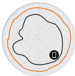
Figure 3. R730 5GHz Azimuth Antenna Patterns