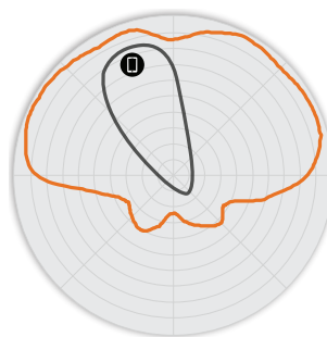
Figure 4. R730 2.4GHz Elevation Antenna Patterns