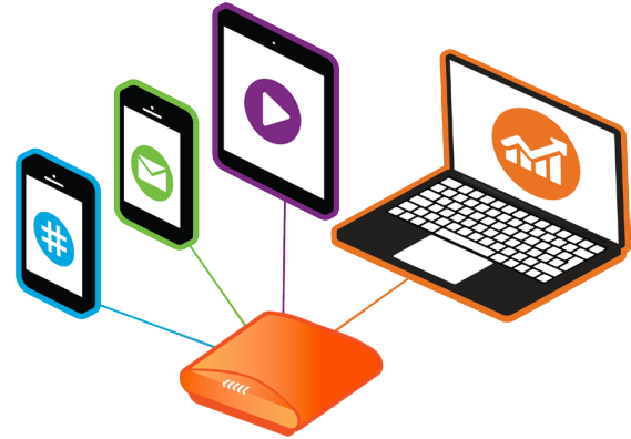
High performing, easy to manage and affordable Wi-Fi Solution

With 802.11ac Ruckus Unleashed access points (AP), users can take advantage of higher speeds, better coverage, and improved reliability. Unleashed APs include key Ruckus technologies, such as BeamFlex+ Adaptive Antenna Technology to maximize signal coverage, throughput, and network capacity, and ChannelFly, our predictive capacity management for RF channel selection. And Zero-IT enables easy device onboarding with several key guest features, such as guest WLAN access, captive portal, Guest Pass, and Custom Logo, to provide key value add services to users.